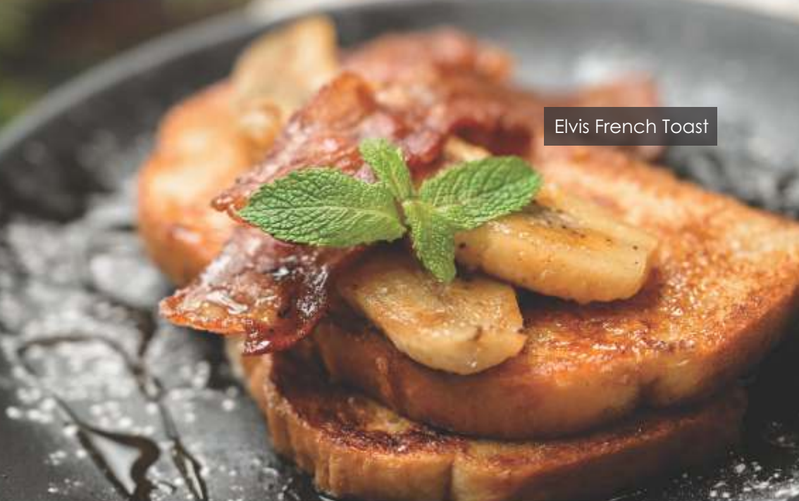
Elvis French Toast