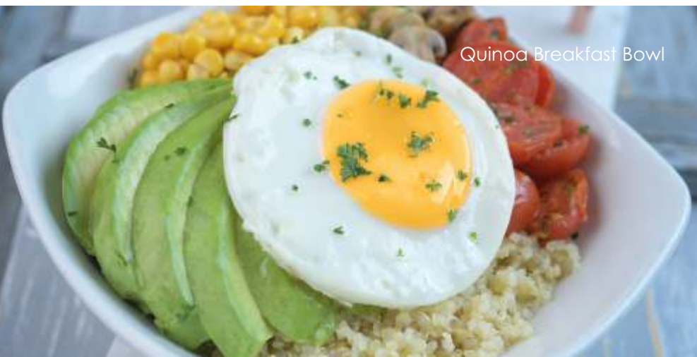
Quinoa Breakfast Bowl

Hearty sweet warm oats topped with banana, almond flakes and cinnamon.