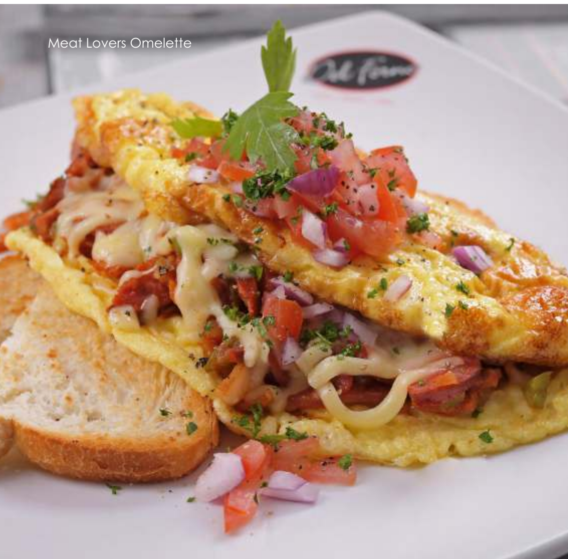
Meat Lovers Omelette

Three egg omelette filled with mozzarella, sautéed onions, green peppers, pressed beef, macon and chourico. Served with toast.